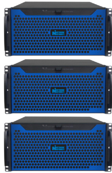
Rack Size: 5U (+) Storage: 144 TB