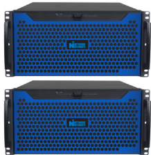
Rack Size: 5U (+) Storage: 48 TB (+)