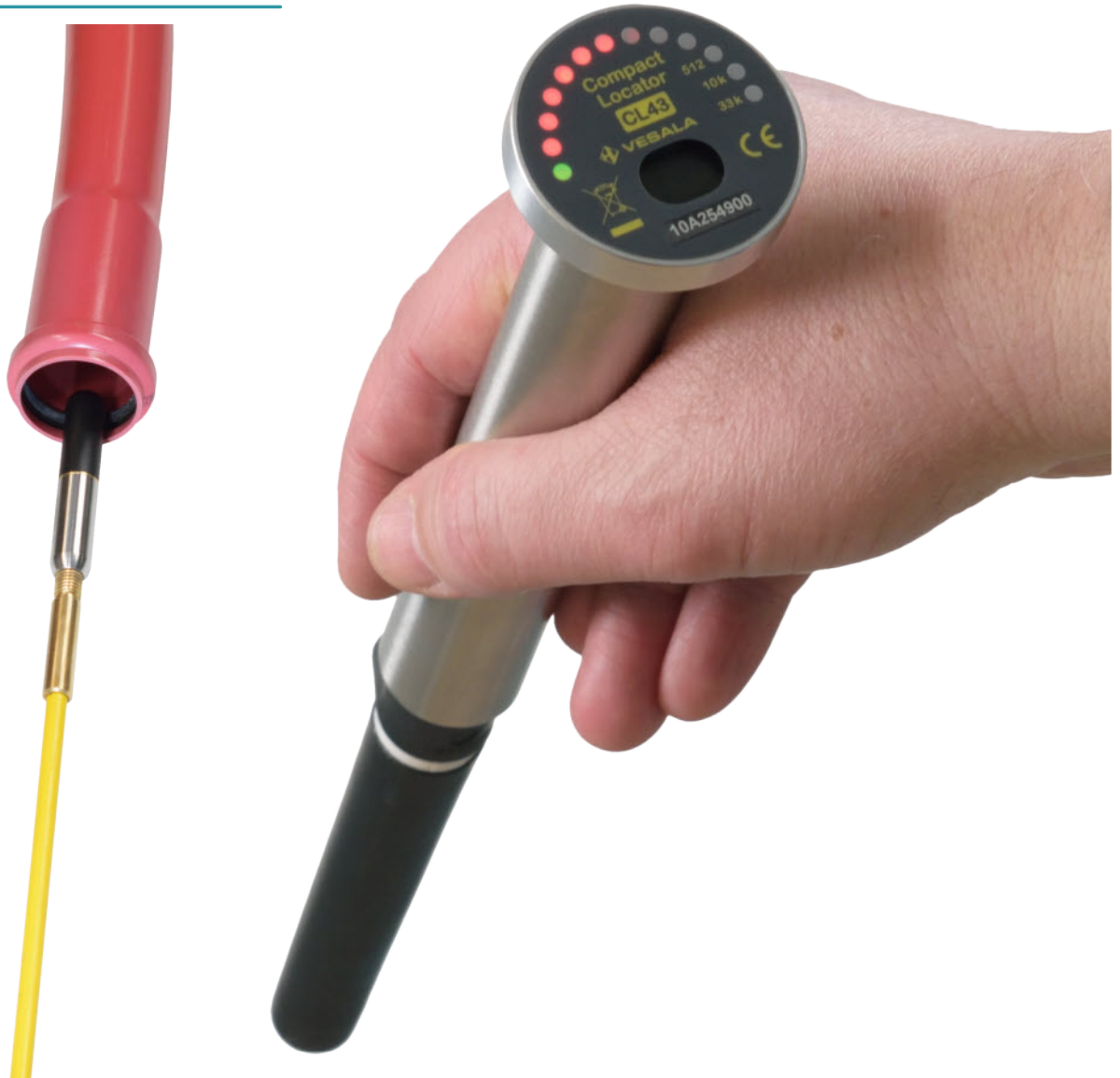
Trace and identify cables on shelves or inside structures using the close range probe